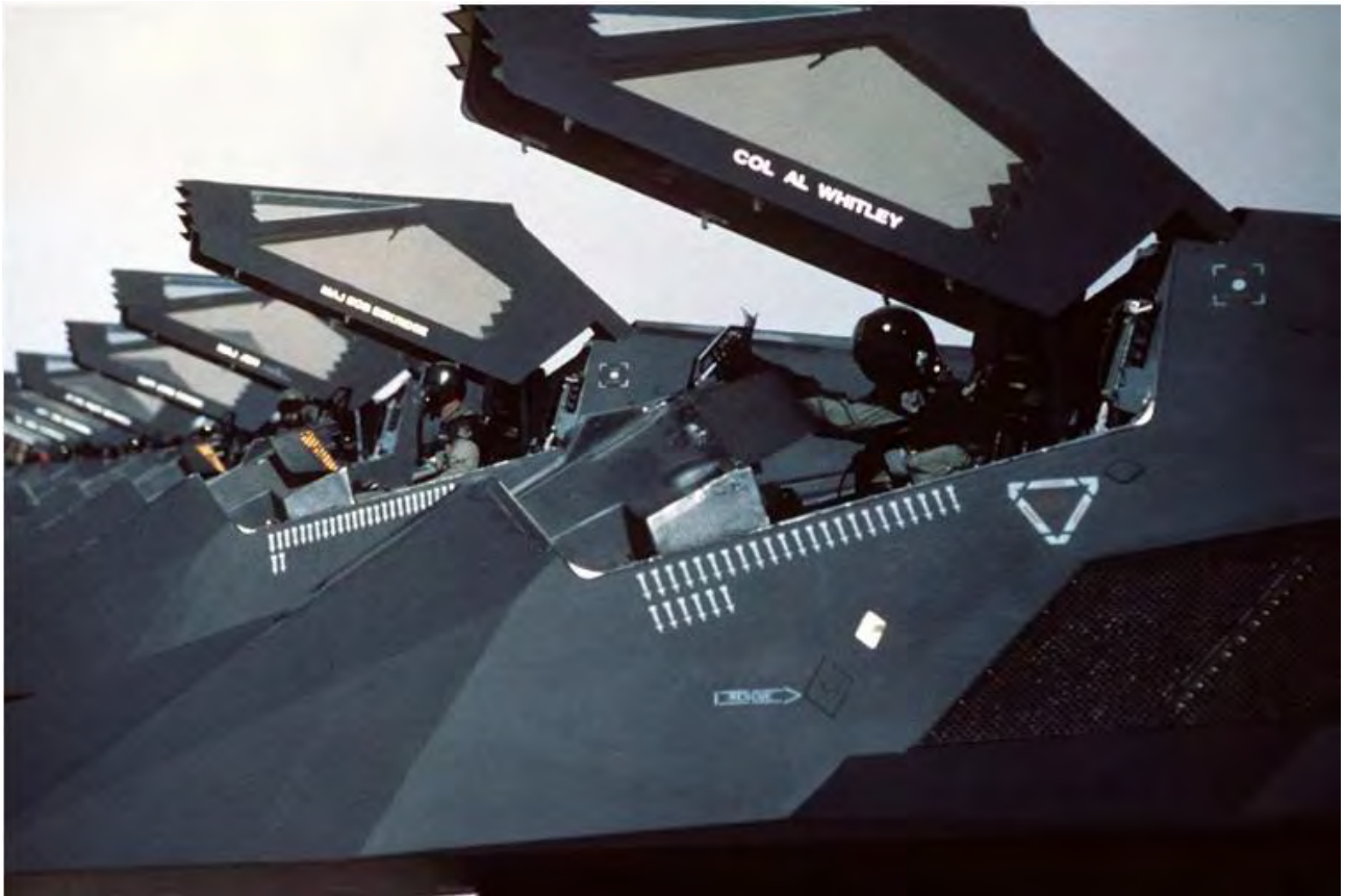
F-117 stealth fighters from the 37th Tactical Fighter Wing stand on the flight line with canopies raised following their return from Saudi Arabia and Operation Desert Storm.

The black jets were consistently assigned the most dangerous, high-priority targets throughout the Gulf War. These included radar sites, SAM and Scud launchers, enemy command/control/communications facilities, bridges, hardened aircraft shelters, and bunkers. Their data recorders provided some spectacular video footage for Air Force publicists. These included a hardened Scud storage facility destroyed by a laser-guided bomb dropping through an air duct; one bomb blowing in the door of an ammunition bunker and a second bomb flying through to explode inside; and a GBU-27 flying down an elevator shaft to detonate deep within the Iraqi Air Force headquarters, blowing out all four walls.