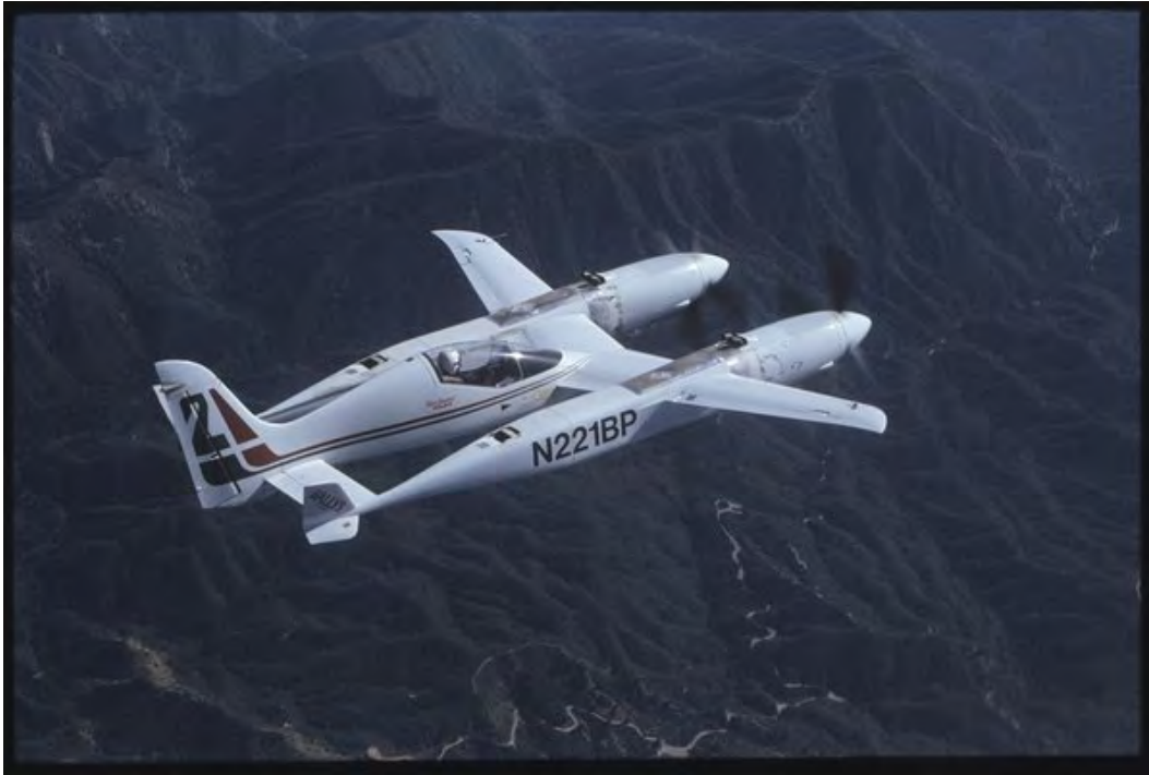
Pond Racer was an oddball, typical of designs from Burt Rutan's Scaled Composites. (Jim Dale)