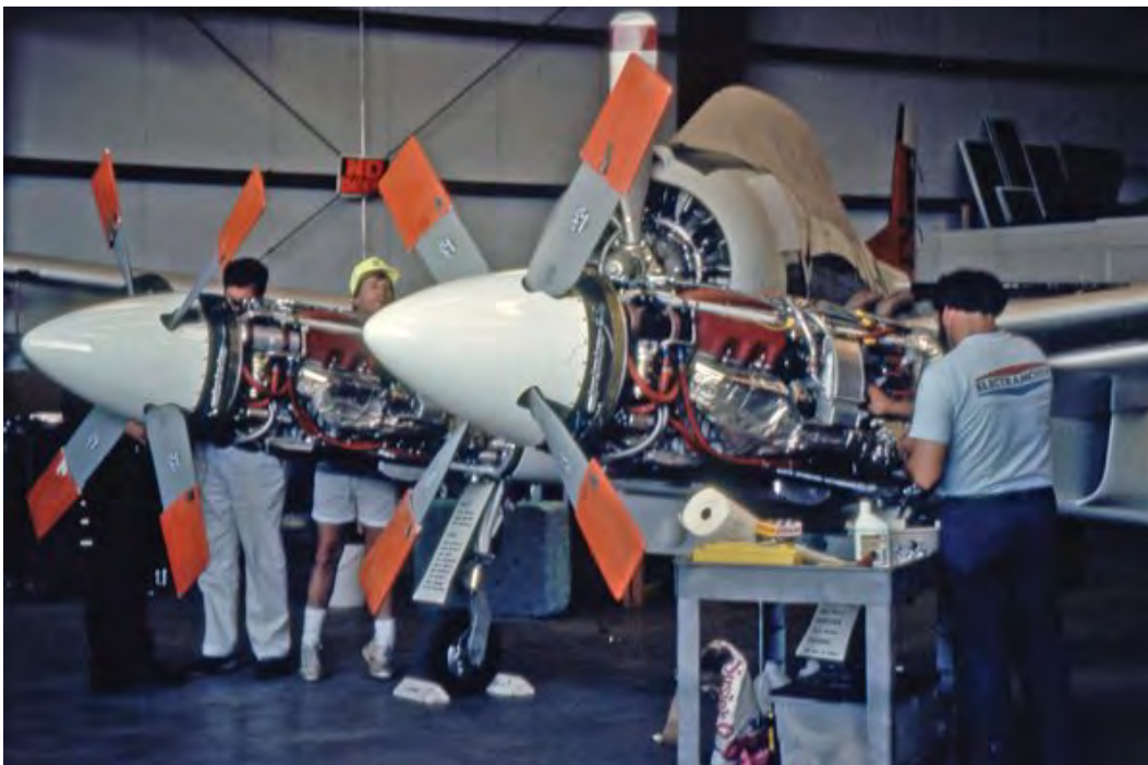
Pond Racer's troublesome engines barely fit in their cowlings.