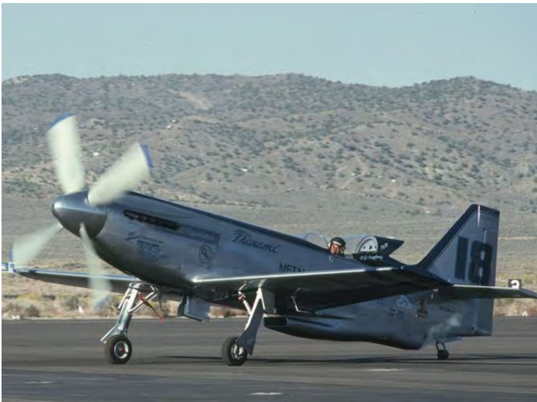
Tsunami looked like a warbird and had the power of the 1940s fighters it was built to replace: It used the same Rolls-Royce V-12 Merlin engine.