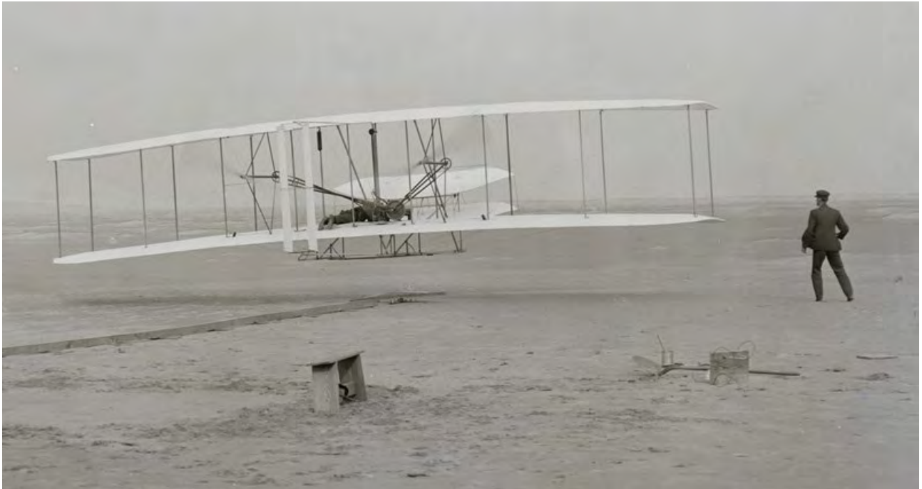
Proof of concept: December 17, 1903, Kitty Hawk, North Carolina.

The Wright brothers' original patent application for a "flying machine," which had been missing for 36 years, has turned up in an underground storage center in Kansas. The find, reported in detail in The Washington Post and The Kansas City Star over the weekend, came 113 years, almost to the day, after the brothers filed their patent on March 23, 1903.