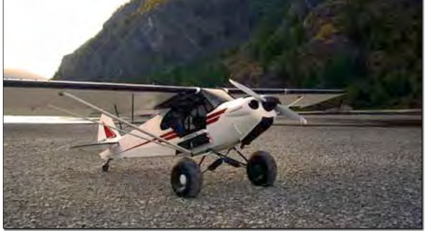
Although factory-built (SLSA) Carbon Cubs far outnumber customer-built Experimentals, CubCrafters is dedicated to making the best Cub kit possible. Shown here is a homebuilt Carbon Cub EX.

Two things set the Carbon Cub apart from the competition: the completeness of the kit and the price. The three sub kits cost $21,660 each and provide all of the parts for the wings, the fuselage and what the company calls a finishing kit. After that you can purchase a firewall-forward installation kit for $8490, a special lightweight CC340 engine that makes 180 horsepower for $27,500, and a Catto composite propeller for $2050. Finally, a VFR instrument panel and the related wiring come in at $14,990, and you get a grand total of $118,010. After you spring for a nice paint job and deal with your state's tax man you only need to add several hundred hours of your own labor to be flying the plane of your dreams.