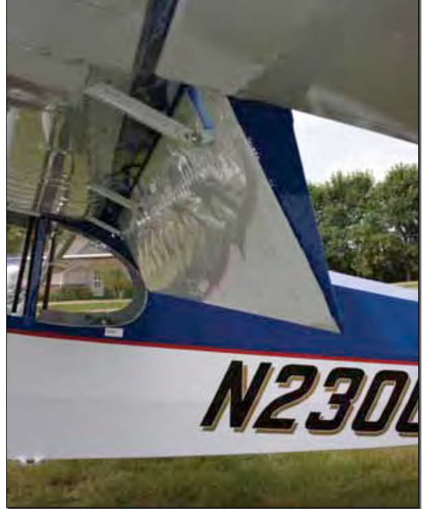
The Dakota Cub's massive flaps combined with the leading-edge slot setup make for impressive STOL capability.

angles of attack, and thus very low speeds. Landings at 30 mph are possible with the Dakota Cubs, but extremely low speeds do need a fair bit of power to control the sink rate. These Cubs are derived from certified airplanes, so every part is covered by an FAA parts manufacturing authority (PMA) or type design. This ensures a level of quality control and documentation that Experimental-only manufacturers are not required to meet.