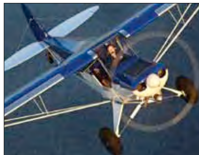
The Dakota Cub Super 18-160 sports the economical Lycoming O-320 engine making 160 horsepower. Many Super Cub drivers prefer the lighter 160 over the more powerful but heavier 180-hp Lycoming.