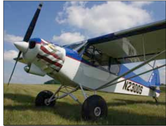
The Dakota Cub Super 18.

The North Star kit is $49,500, and excludes readily available hardware items. The NKET has not evaluated this kit for amateur-built compliance, but there is no reason to believe that the FAA would not accept it as amateur-built. It just makes for some extra work to prove it.