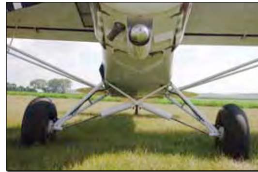
A Dakota Cub with the Alpha Omega Suspension System (AOSS). It was developed by Burl's Aircraft in Chugiak, Alaska, and features low-rebound polyurethane "pucks" inside the canister. The system is designed to soak up the bumps of landing on a rough strip, enabling bush pilots to get on the brakes quicker and reduce the abuse the landing gear takes. AOSS is an option on Dakota Cub kits.