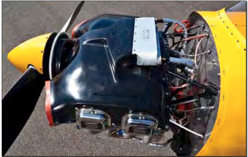
CubCrafters' impressive 180-hp CC340 engine plays an important role in the company's quest to make the Carbon Cub as light as possible. Cooling is provided by a slick looking carbon-fiber plenum that forces the maximum possible amount of air over the custom-built engine.