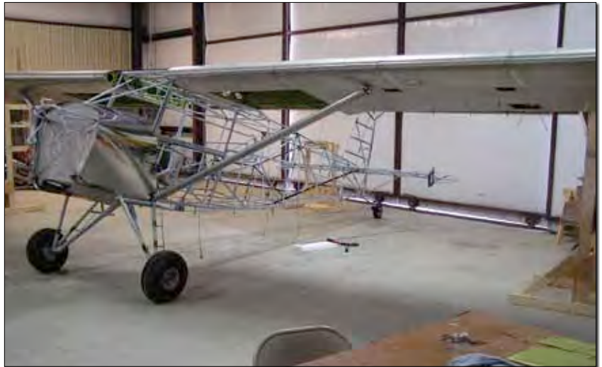
A Bearhawk Patrol ready to cover. It is usually much easier to run as many of the internal systems as possible before covering the fuselage with fabric. Unlike the other kits considered, the Patrol has metal-covered wings.

Patrol kits are available either as a quickbuild with the fuselage completely welded ($37,105) or as a basic kit with some welding still left to do ($30,825). Both include wings that are substantially complete except for installing fuel tanks, wiring and closing out. National Kit Evaluation Team (NKET) approval as an amateur-built kit is pending, awaiting completion of the assembly manual (as of this writing).