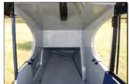
The Dakota Cub has a cavernous cargo area that extends well aft of what is found in the standard Super Cub.