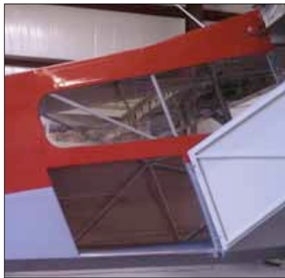
A large door makes it easy to access the ample cargo area of the Bearhawk Patrol.