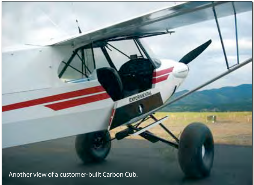
Another view of a customer-built Carbon Cub.