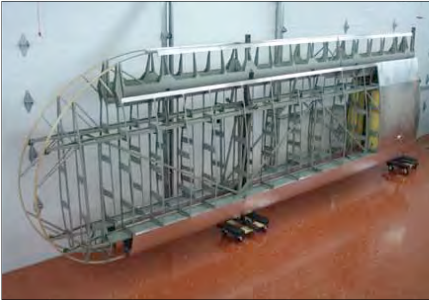
A pair of Javron wings is ready to ship to a builder. These sport the traditional Super Cub round wingtips. There are a lot of parts in these wings, so having them pre-assembled in factory jigs saves the builder a lot of time.

has a lower stall speed, its weight may negate some if not all of the benefit of that lower stall speed. In other words, it