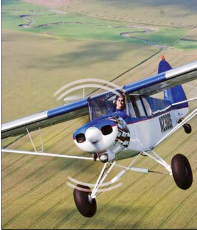
A Dakota Super 18 on 26-inch Alaskan Bushwheels shows off its patriotic paint job.