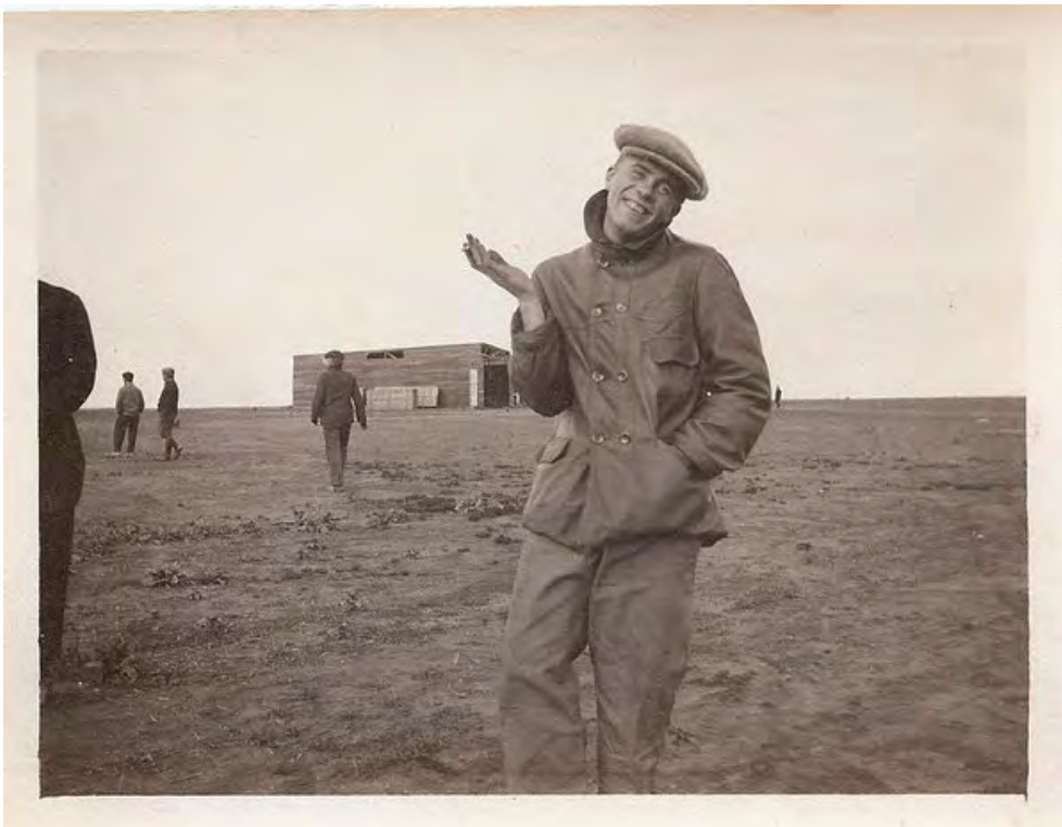
Goofing around on tour, ca. 1911; things would soon turn tragic.