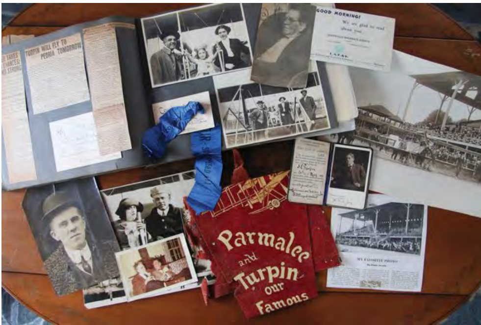
His scrapbook, filled with invitations, photographs, news clippings, pennants, and postcards, documents his flying career, which lasted less than two years.