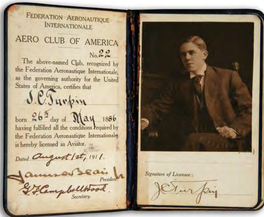
Turpin earned his Fédération Aéronautique Internationale pilot's license—number 22—in 1911.