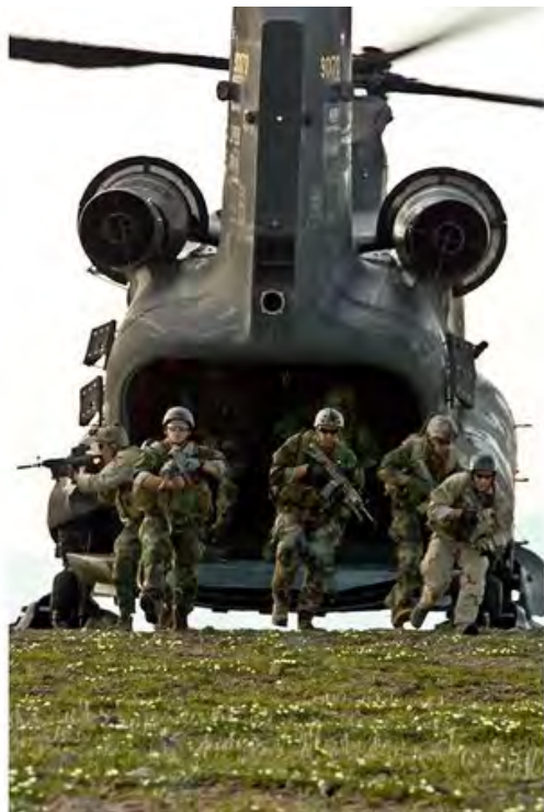
Extortion 17's ground force prepped for a swift exit, like these Navy SEALs charging from a CH-47 during training.

The mission had begun about four hours prior to the shutdown, when the two helicopters touched down side by side in Juy Zarin, a village in the bare rock-walled Tangi Valley of Wardak Province. As two U.S. Army AH-64 Apache attack helicopters, an Air Force AC-130 gunship, and a small fleet of unmanned surveillance aircraft orbited overhead, a platoon of the 75th Ranger Regiment and members of an Afghan special operations unit stormed down the rear ramps of the Chinooks and into the night. Their target: an Afghan named Qari Tahir and his group of fighters. Intelligence had revealed Tahir to be the senior Taliban chief of the Tangi Valley region, with probable ties to upper-echelon Taliban leadership in Pakistan. As the ground assault force rushed toward Tahir's compound, Extortion 17 and 16 sped back to base, where they were refueled, and awaited word to extract the team, evacuate wounded, or race reinforcing troops to Juy Zarin.