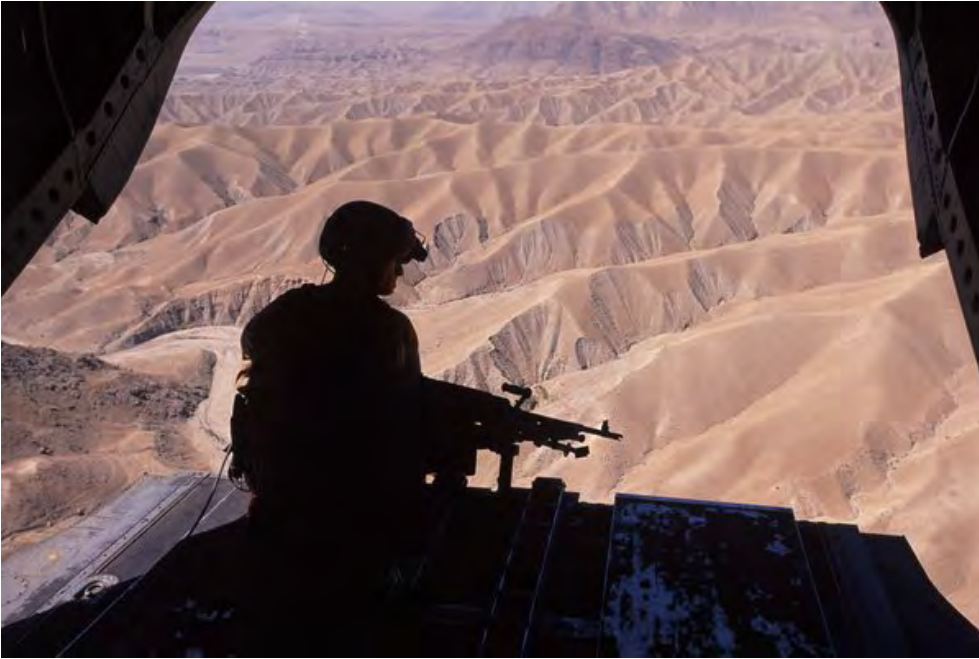
A Chinook rear gunner surveys the dangerous terrain between Kabul and Jalalabad. (Ed Darack )