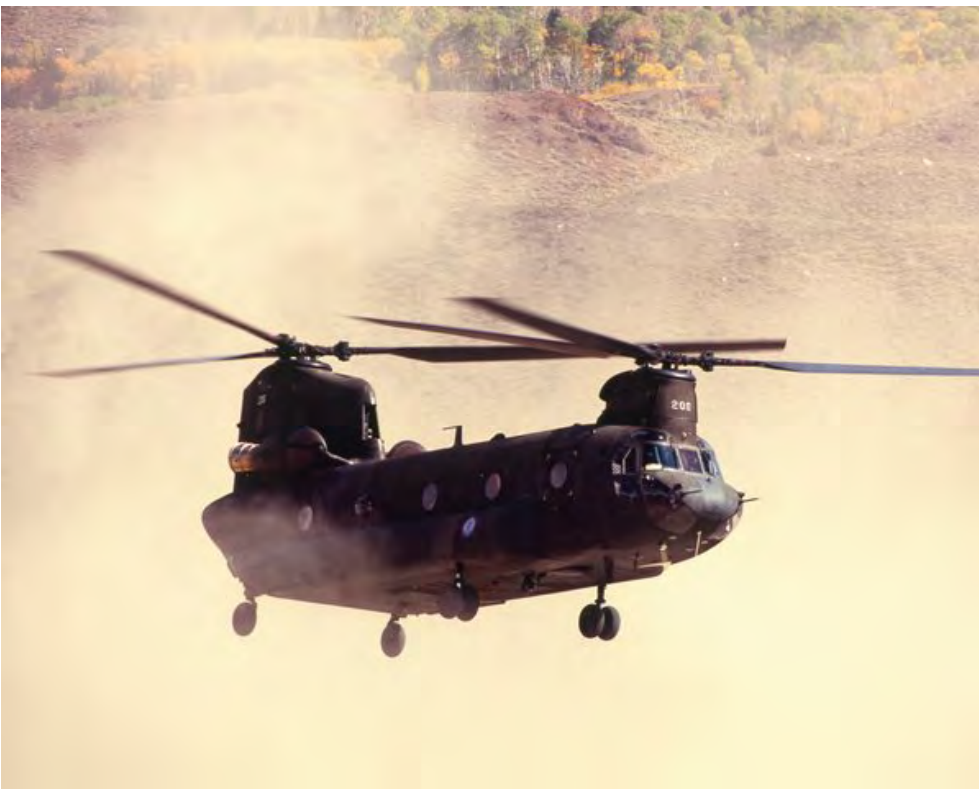
A CH-47 descends for a landing at the U.S. Marines' Mountain Warfare Training Center near Bridgeport, California. Chinooks perform superbly in the hot-and-high conditions of Afghanistan, and U.S. commanders often request them. (Ed Darack )