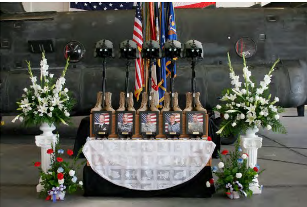
At Dover Air Force Base, a memorial for the five U.S. Army soldiers killed in the crash included their boots, firearms, and helmets.