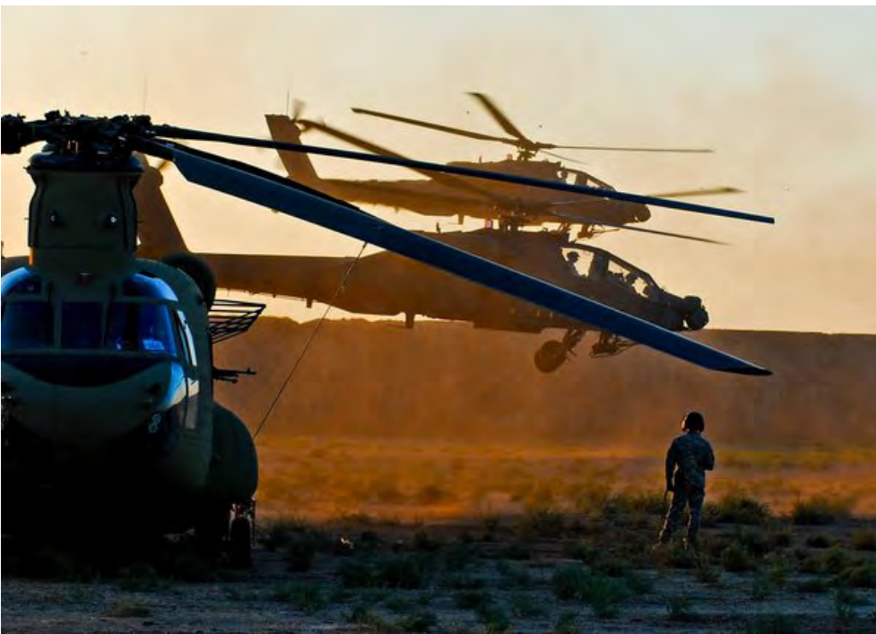
Extortion 17 was accompanied by two AH-64 Apaches, like the pair lifting off behind a CH-47, as well as an AC-130 and UAVs. Sometimes the presence of gunships is enough to deter attackers; their presence is sometimes reinforced by firing into trees.

When the two Chinooks had first touched down in the village, a group of eight fighters armed with AK-47 rifles and RPG-7 rocket-propelled grenade launchers bolted from the