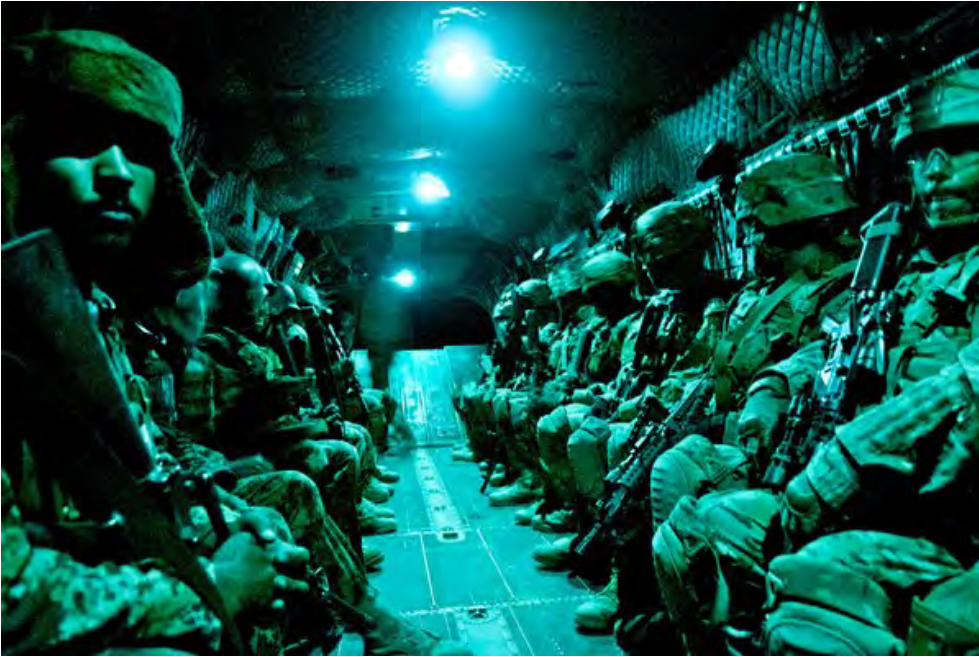
The ride to a raid can be tense. In this Chinook, U.S. and Afghan special operations forces fly to a night mission in Ghazni Province in 2012.