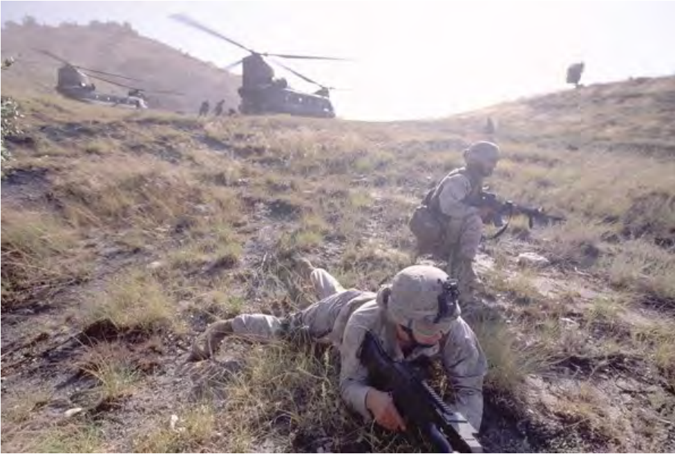
U.S. Marines and Navy corpsmen fan out from a CH-47 in Kunar Province, Afghanistan, on a 2005 operation to find a Taliban mortar position. On leaving the helicopter, an inserted force usually first establishes a defensive perimeter.