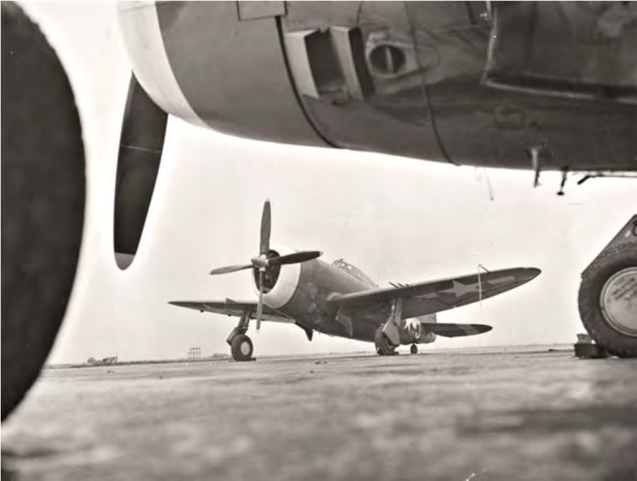
Many P-47s got larger "stars and bars" markings so Allied troops wouldn't shoot at them. Still, several P-47s were lost to friendly fire.