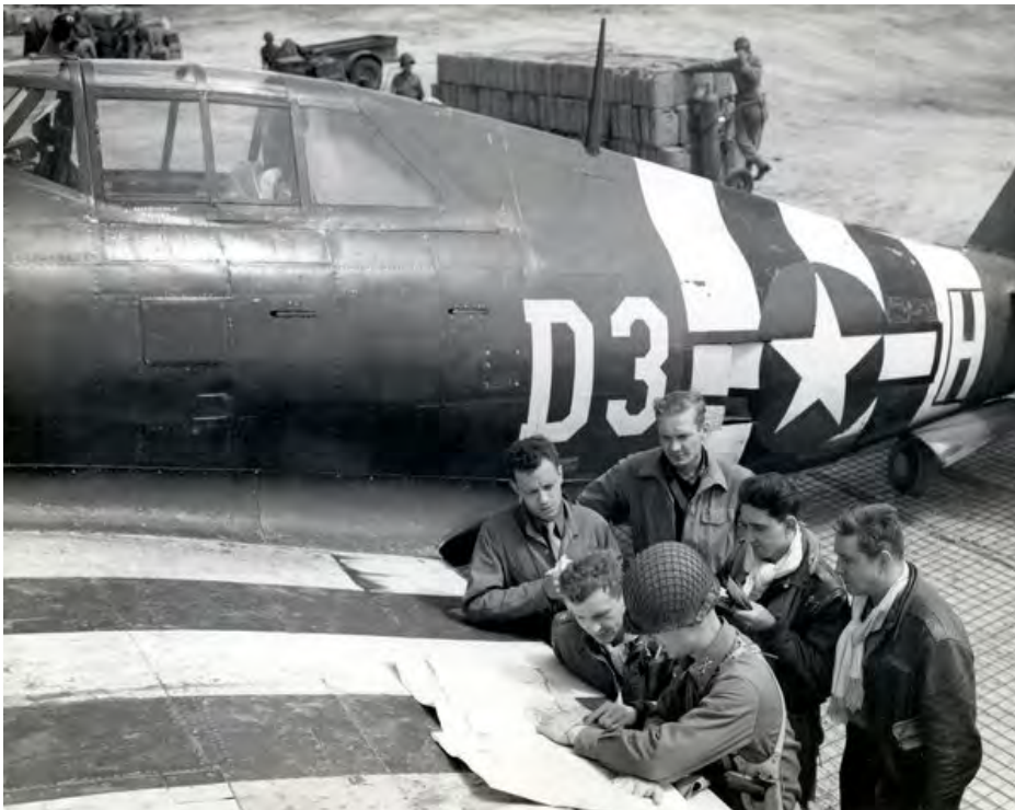
With troops finally on French soil, pilots and tankers coordinated to direct air support and avoid deadly friendly-fire mistakes.