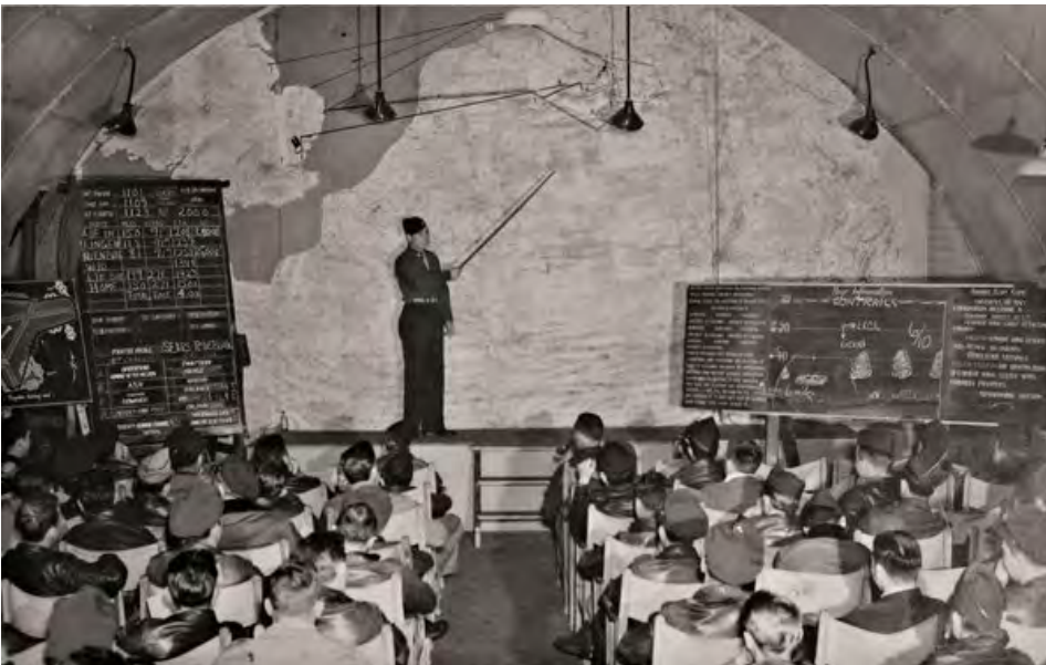
Before each mission came lengthy briefings. Here the 353rd Fighter Group at Raydon coordinates an escort run.