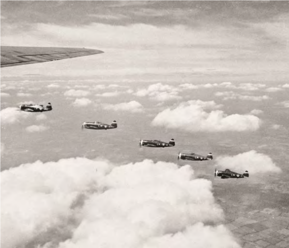
Dangerous job: Only one of five pilots in this 1943 photograph survived the war.

Fighters, half-again as fast as a typical attack airplane, had a degree of speed and agility that made them much more survivable than the light, low-level attack bombers intended for the job. And this fighter had an imposing appearance: Its tail-sitting attitude, wide-stance landing gear, and flat-face radial engine gave it the aggressive look of a bulldog. With a 2,000-horsepower Pratt & Whitney R-2800 18-cylinder radial engine, it could fly faster than 400 mph. And it was big. Its porcine fuselage—necessary for housing the complex ducting running from the turbo-supercharger to the engine—earned it the nickname “Jug.” The P-47B wing spanned more than 40 feet, and, with an empty weight of more than 9,300 pounds, the fighter was heavier than the Supermarine Spitfire and its U.S. stablemates, the Bell P-39C, Curtiss P-40B, and North American P-51B. Only Kelly Johnson’s distinctive twin-engine P-38 weighed more. The late Donald Lopez, a longtime deputy director of the National Air and Space Museum and a fighter ace who flew P-40s and P-51s during the war, rarely missed an opportunity to joke about the Thunderbolt’s size. In his memoir, he wrote, “the cockpit was so roomy that supposedly, when a pilot was under attack, he could run around the cockpit and yell help every time he passed the radio.”