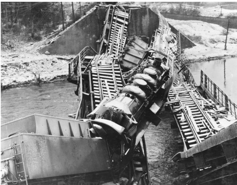
P-47s caught one train attempting to cross the Moselle River. The attack destroyed the train—and the bridge.