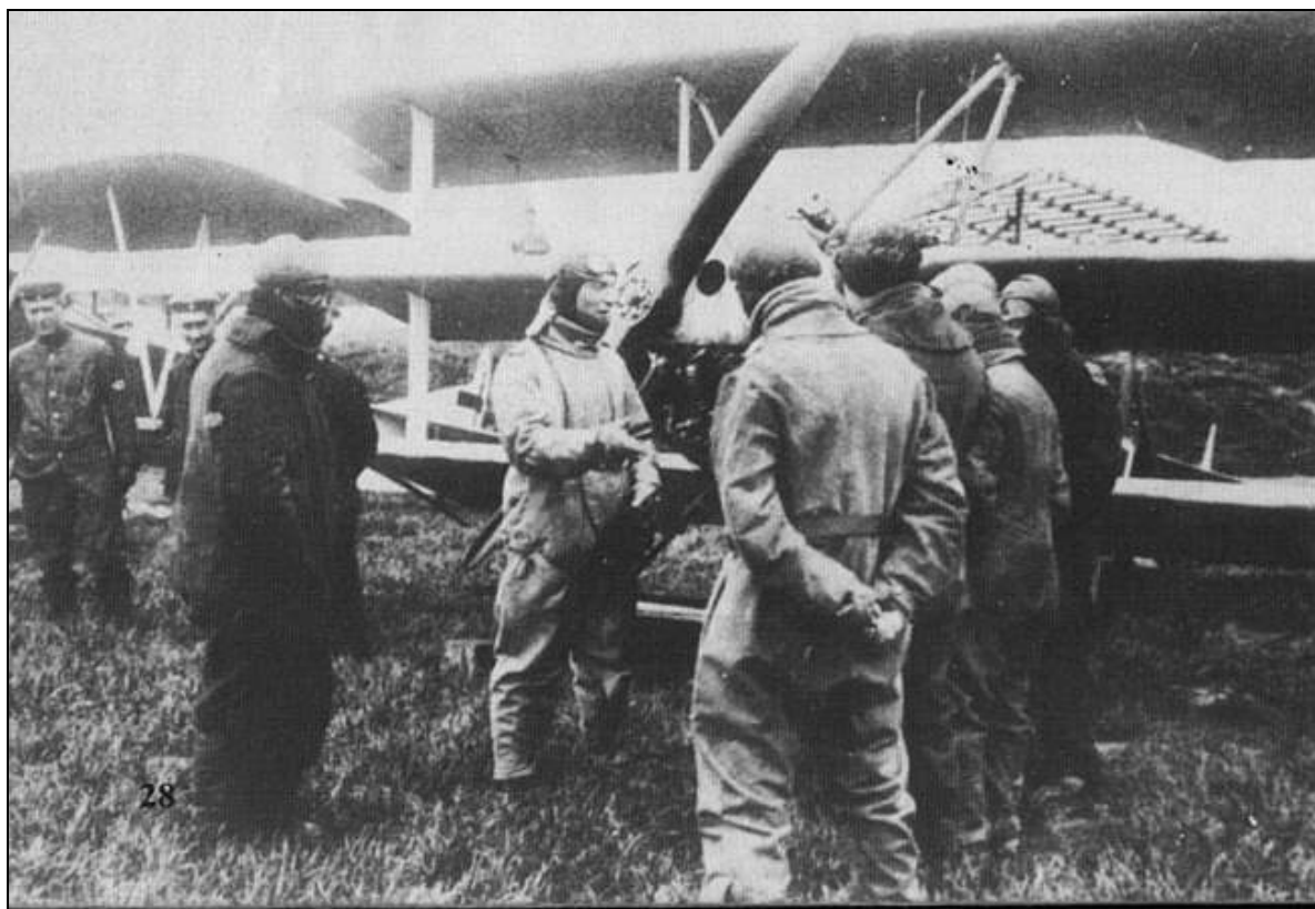
Oblt. Hermann Goering, Staffelfuhrer of Jasta 27, briefing his pilots before a sortie.