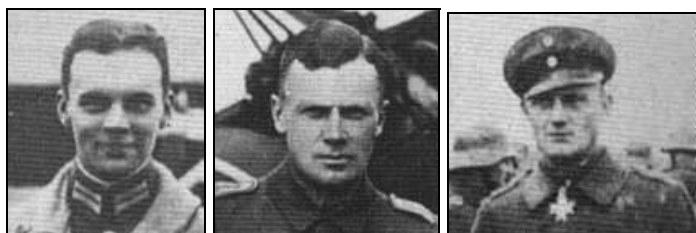
Three aces of Jagdgeschwader 3.

GMC indicates that the ace was awarded the Golden Military Cross (nicknamed the Pour le Merite of the Corporals.)