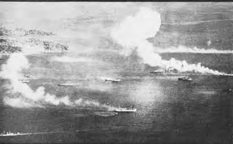
JAP SHIPS OFF EATEN ISLAND ATTEMPT FLIGHT FROM TRUK HARBOR