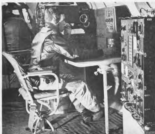
Radio "shack" of the Mars , behind the pilot's cockpit, has ample room; operator has 24 contact points inside the plane