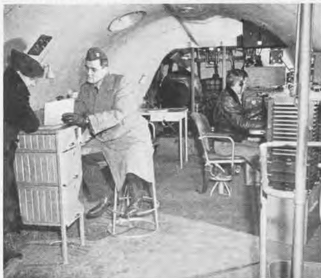
Spaciousness of huge plane is graphically shown in picture looking forward from engine control panel to pilot cockpit

AFTER MANY MONTHS of testing, the giant Martin Mars , world's largest flying boat, has proved itself sea and airworthy as a troop or cargo transport. The Navy has ordered 20 more of the aircraft, to be turned over to Naval Air Transport Service for shipment of vitally needed men and material to war zones. Weighing 70 tons, with a wingspread of 200 feet and cargo capacity of a 14-room house, the Mars is two-thirds again as big as the largest flying boat now in service with NATS. It has a fully equipped galley and sleeping accommodations for 32 men. In an emergency it could carry many more than that. Mars won its spurs by a record-shattering flight from Patuxent River, Md., to Natal, Brazil, following this up with another record round trip from Alameda to Pearl Harbor.