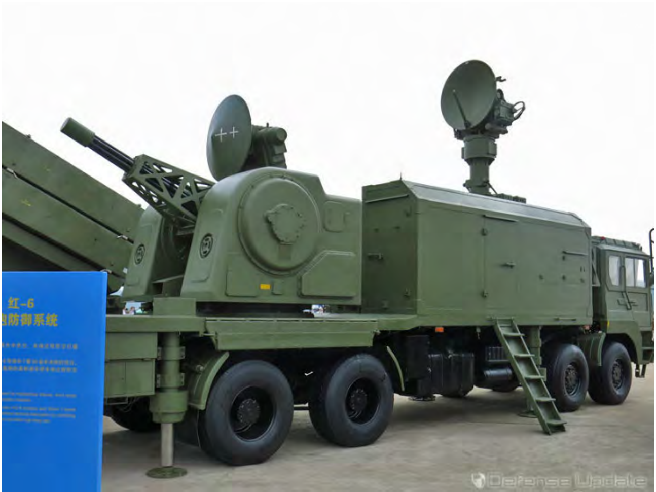
I-6 Short Range Air Defense.

Several Chinese companies have displayed advanced medim range air defense systems at Airshow China 2014. This variant, the FD-2000 was offered by CPIMEC to Turkey. The photo shows the Transporter-Erector-Launcher (TEL) and radar associated with the system.