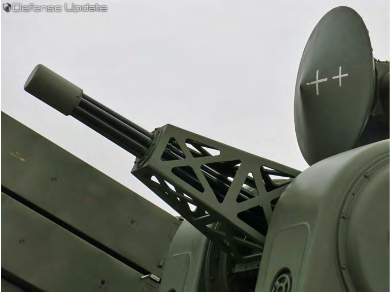
I-6 Short Range Air Defense.