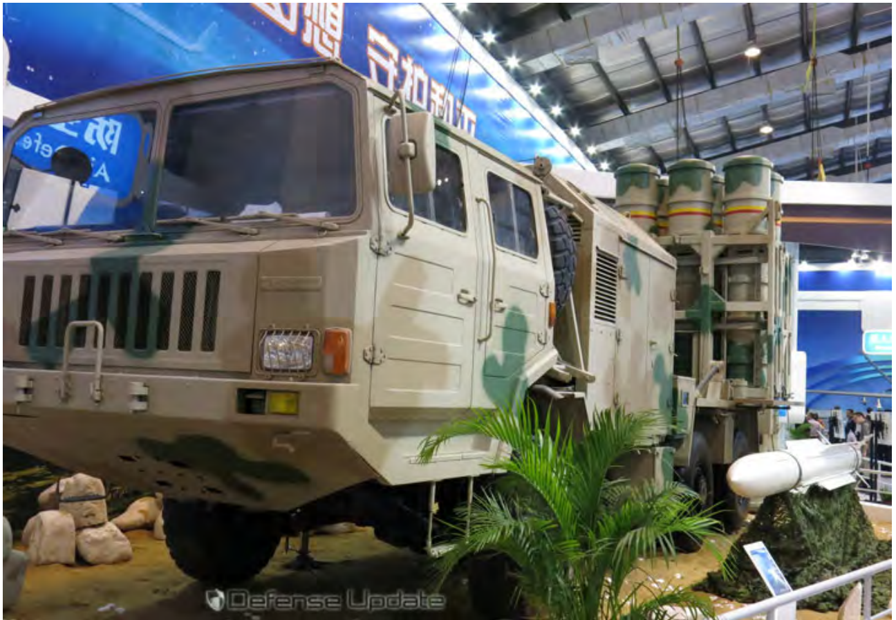
LY-80 SAM