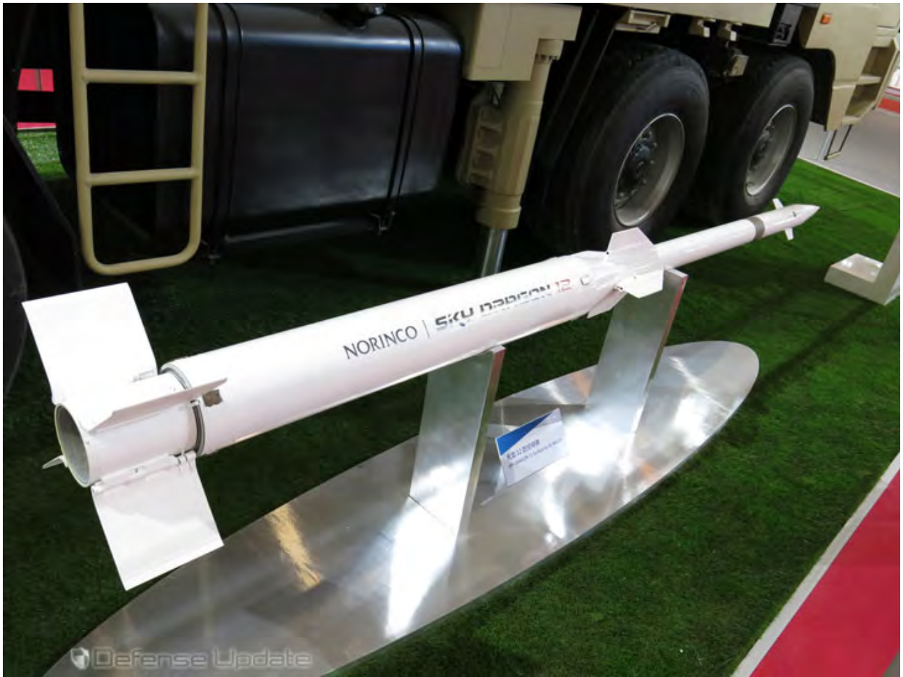
Sky Dragon 12.

LY-80 medium range SAM from China Aerospace Science and Technology Corp. (CASC) providing area air defense of critical assets. The system employs a multifunction phased array tracking and guidance radar searching at ranges up to 140 km. The system uses a combined guidance system employing both ground illuminating and semi-active homing, at ranges up to 85km. Interception altitude from ground level to 15 km, at ranges of 3.5-40 km.