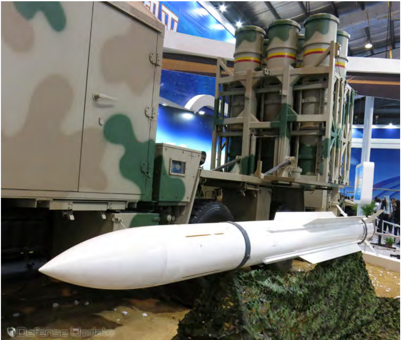
LY-80 medium range SAM.