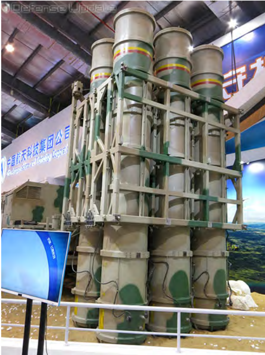
LY-80 SAM.