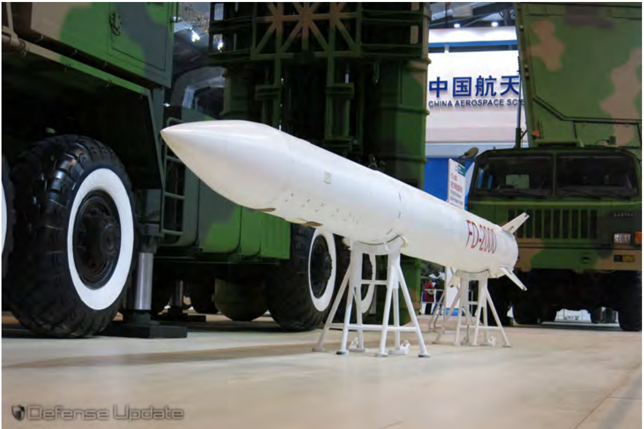
FD2000 – China's S-300.