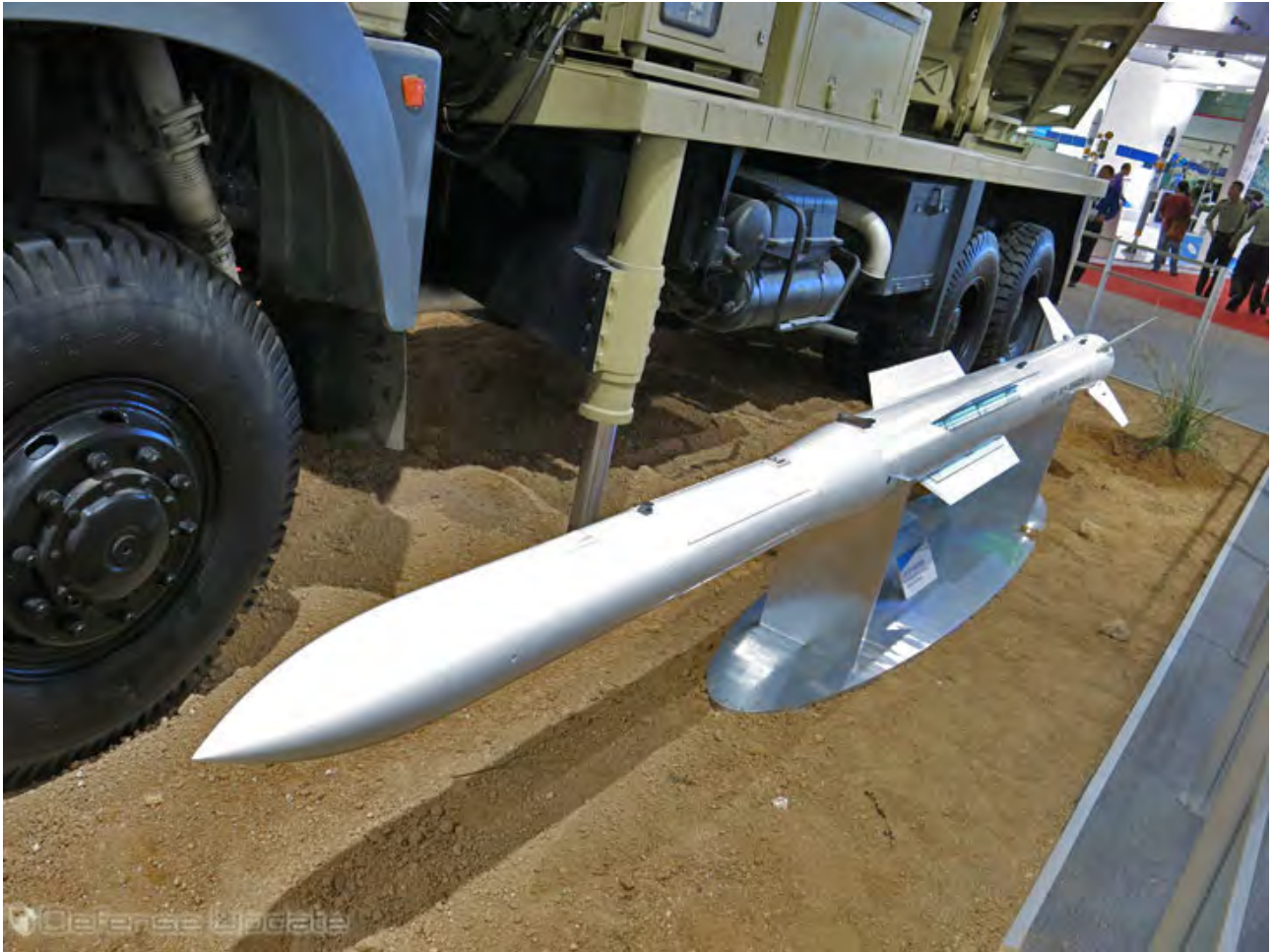
Sky Dragon 50.

Sky Dragon 50 medium range SAM displayed by NORINCO. The system is designed for low, medium and high altitude air defense at ranges of 50 km. The SAM unit comprises a single IBIS 150 3D target designation radar and one fire distribution vehicle, controlling 2-6 mobile fire units each carrying four launchers.