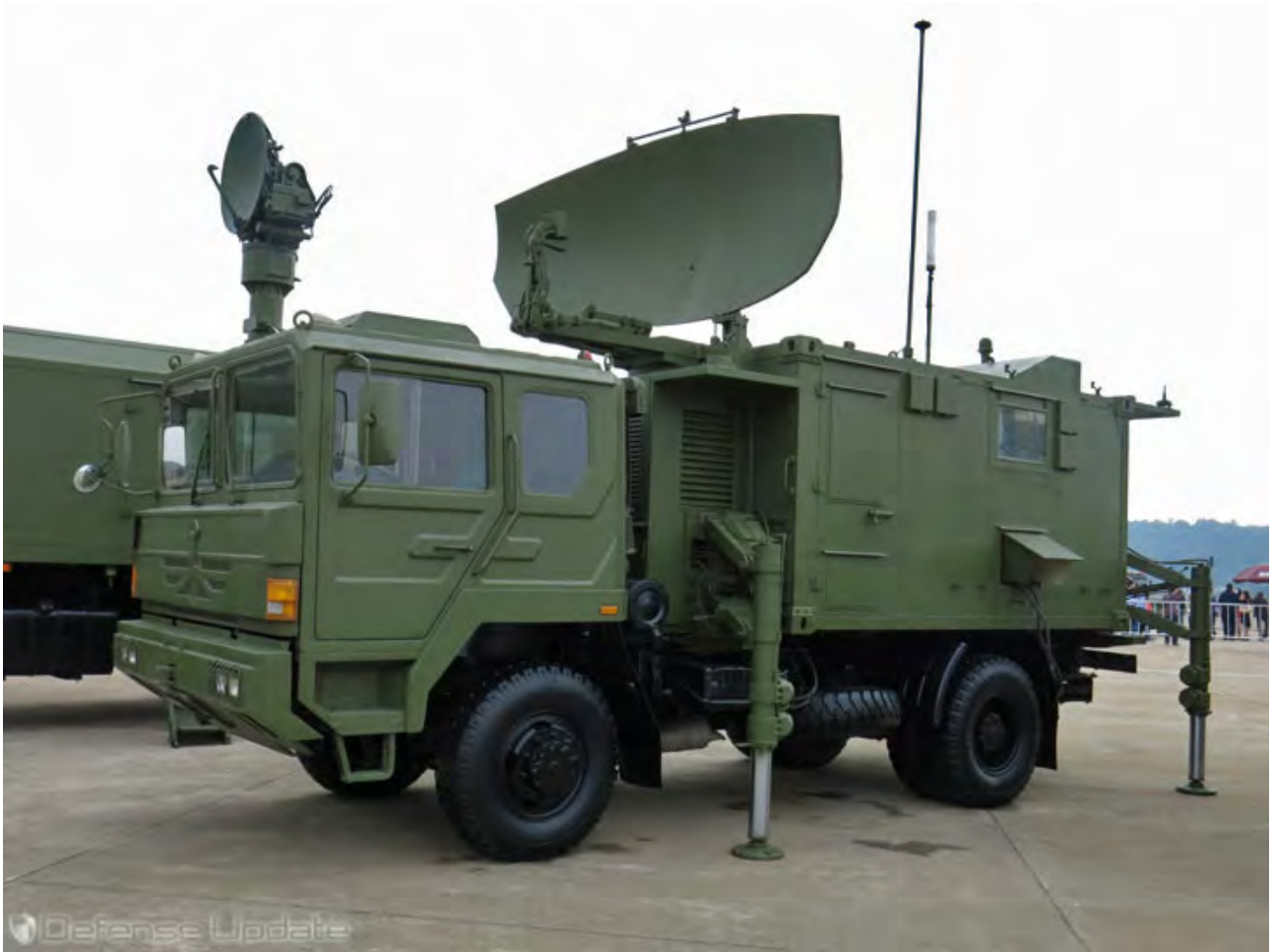
I-6 Short Range Air Defense.

I-6 short range air defense system. The I-6 integrates the HQ-6 missile system and 7 barrel 30mm anti-aircraft artillery and command and control vehicle carrying a low-altitude search and target acquisition radar. Both gun and missiles are designed to provide a terminal defensive layer protecting the I-9 weapon system against air attacks by stand-off precision guided weapons, covering medium to low altitude.