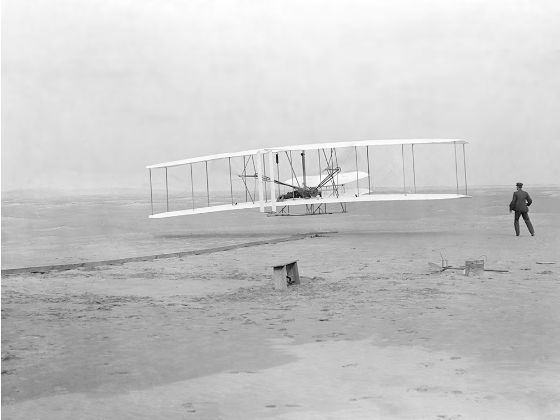
Orville Wright's first flight, Dec. 17, 1903

keep up with advances in knowledge. They can even lose the knowledge they had but refuse to recognize that they are no longer the wunderkinder of their early years.