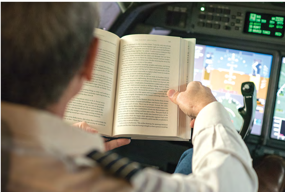
An inattentive pilot.

Such a pilot is not necessarily unskilled or ignorant. The former can be trained and the latter can be educated. A problem pilot is one who lacks the proper attitude and respect toward the profession either through a set of temporary circumstances or a more deeply ingrained driving force.