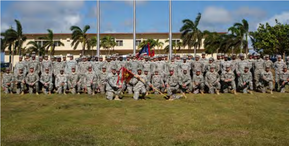
Alpha-2 at Andersen Air Force Base, Guam, 2015. Since March 2013, a THAAD anti-missile battery has been deployed to Anderson to deter a North Korean attack.