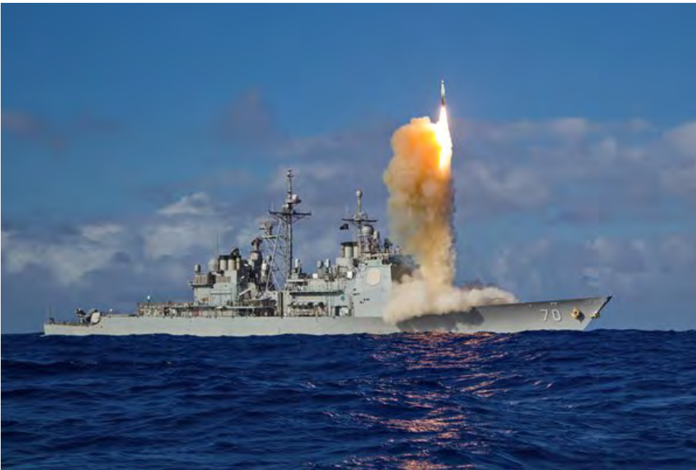
In May 2013, the USS Lake Erie fired an SM-3 that intercepted its target, which had been tracked by Aegis radar. Since 2002, the Aegis system has hit 32 targets in 39 tries. (US Navy)

The trucks supporting the control vans were parked side by side a quarter-mile or so from truck-borne launchers. Communications cables connected one to the other, as well as to satellite and ground antennas that link to off-site command centers.